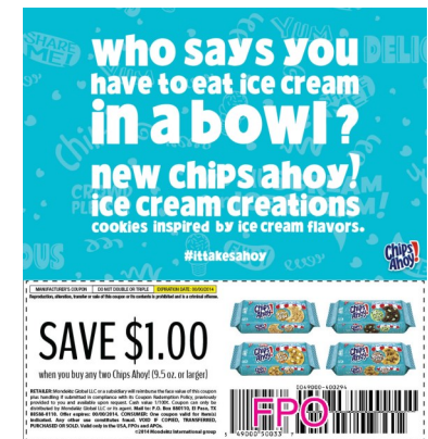
Back of Coupon