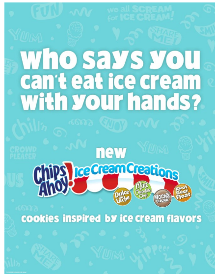
Large Easel Card (Display on table)