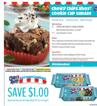
Front of Coupon